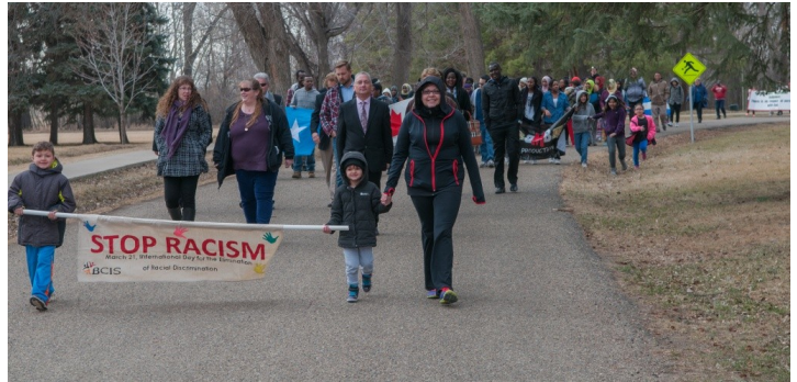
Unity Walk 2016