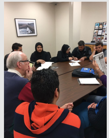
Café Conversation at BCIS

They also use this as a platform to improve their English language skills. It is through such interactions that they learn new social skills and also make good friends. The group is facilitated by our dedicated volunteers, Brian and Norma Dunlop.